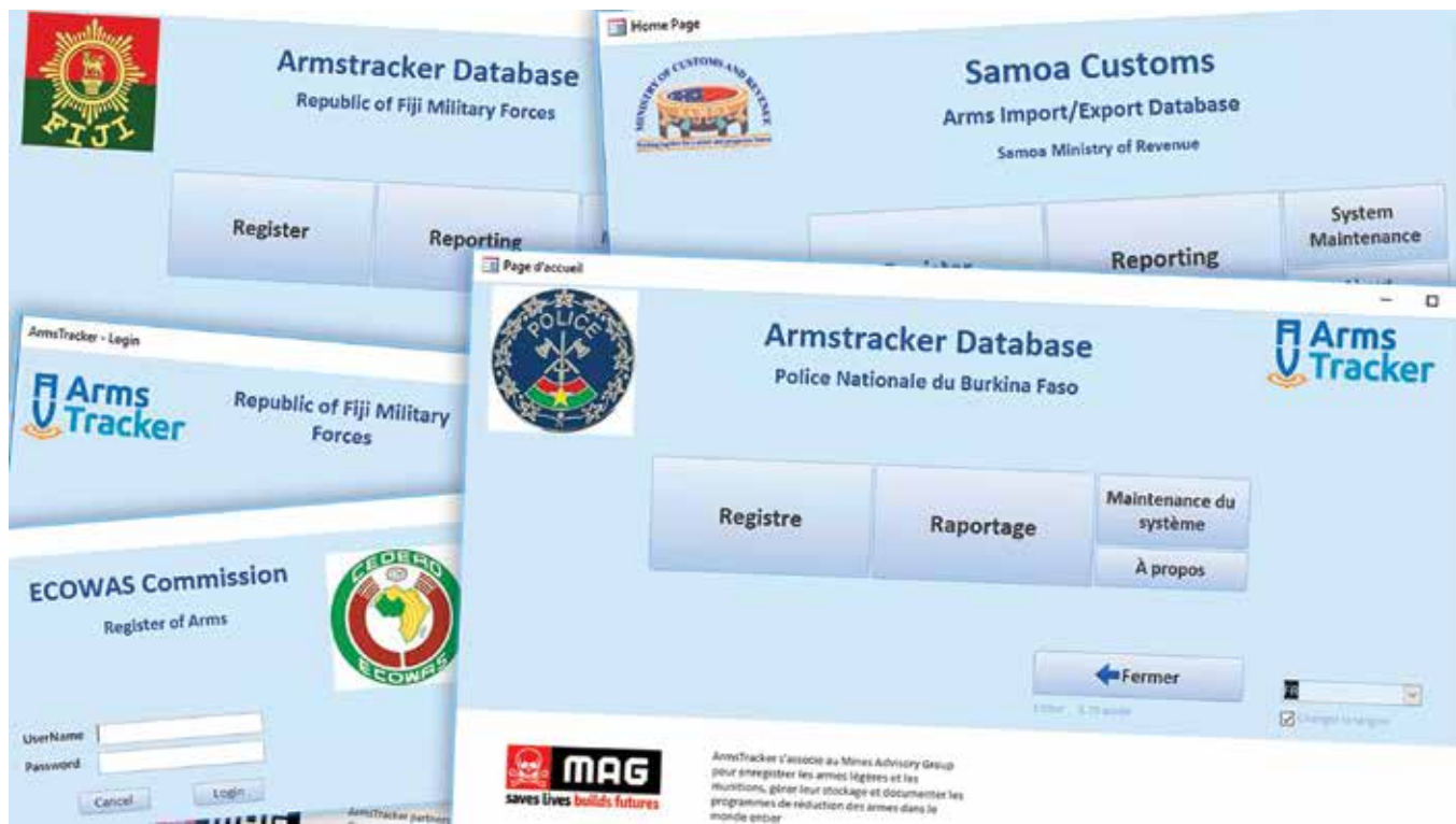
A collage of ArmsTracker screenshots showing the home or login pages of several installations. Installed with government agencies across the Pacific and Africa, ArmsTracker can be switched to local languages.

now face an ever more pressing need. Despite many attempts, no digital record-keeping solution for state-owned arms has emerged to standardize the ongoing management of stockpiles of arms and ammunition in low-capacity countries. 5