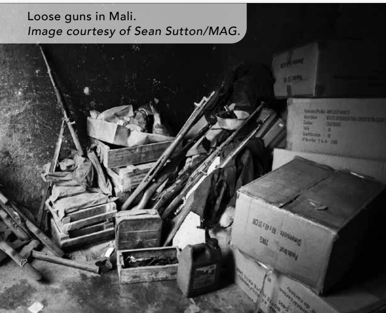
Loose guns in Mali.