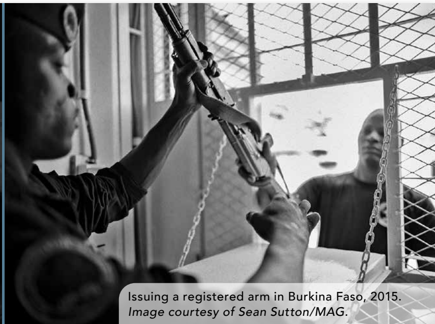
Issuing a registered arm in Burkina Faso, 2015.